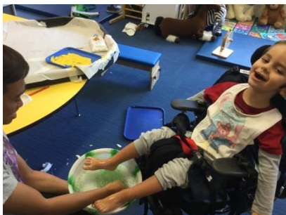
Seacole Class and Snowdrops exploring changes through colours and textures.