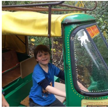
Tulip Class at the London Zoo!